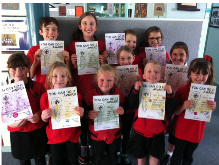
Our award winners from assembly on Monday.